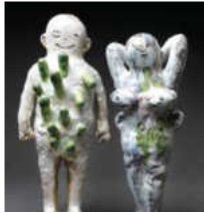
Two Nudes (detail), 2007, ceramic with china paint, 20" x 7" x 7" each

There is something endearing and quaintly reassuring about Kim Tucker's ceramic creatures. Hers is a menagerie of misfits, and we are drawn to their strange, anthropomorphic qualities. In her most recent Imperfect Eden series, Tucker's creations are human and animal, or in some cases composites of humans, animals, and other aspects of nature. They