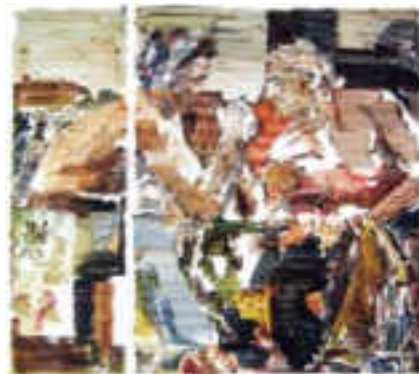
Strategies of Commitment , 2008, acrylic on canvas, 36" x 30"

U sing the male figure as his subject, Miller Updegraff grapples with the complexities and nuances inherent to the representation and assertion of power. Updegraff began his inquiry into male privilege and influence through his research on the exclusive Bohemian Grove — the clandestine working-vacation spot for the world's über-males, the ones who pull the global puppet strings — depicting his supremely authoritative subjects frolicking in the nude and engaged in frivolous play (events