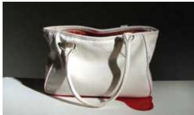
Still from Blood Work , 2009, HD Video, 3:00 minutes. Courtesy the artist and The Company, Los Angeles, CA.