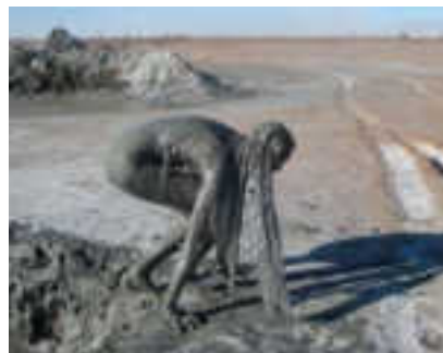
Mud , 2009, video, size variable

slowly writhe; a woman swims in a giant sphere of dark water; flickers of flame mimic a body in motion; a larger-than-life face stares straight at us, each blink of its eyes demarcating a new moment. Such manipulation of time, in which each instant is greatly measured, introduces a presence of its own and enhances the intimacy of the exchange. We feel as if we are in communion with Prosenec's subjects. Dark and mysterious, the work speaks of transformation — visually, as the terrestrial becomes the majestic, and metaphorically with the passages of life. Without being sexualized, her work is highly sensuous: the sinuous curves of the body and the primal attraction of the core elements enrich the experience of their engagement. www.kanalyapictures.com/filmography.htm –AMcE