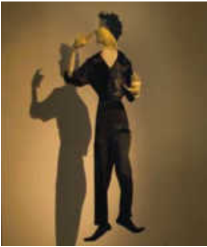
In Defiance of Gravity, performance at Steve Turner Contemporary, May 2009.