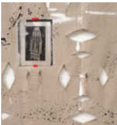
Sieve (detail), 2009, canvas, gold hoop earrings, thread, crocheted doily, single earrings, monogram pins, vintage iron-on, wooden thumbtack, gold-plated pendant, rhinestone earring, ceramic pinch pots, aluminum thumbtacks, latex, acrylic and Xerox transfer on cut canvas drop cloth, 144" x 108" x 6".

As far as I know, L.A.-based installation artist Amanda Ross-Ho holds the current record for amount of kitty litter included in a Whitney