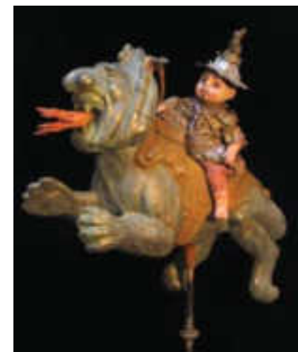
El Tigre , 2008, mixed media, 60" x 36" x 22"

taches painted on the saintly stand-ins. Precisely executed and inflected with a Monty-Pythesque wink wink nudge nudge, Van Clapp’s work re-appropriates the common into the sublime (or vice versa). He is not an iconoclast for iconoclasm’s sake; rather, as he sifts through the fool’s gold of unquestioned authority and alleged absolutes, Van Clapp seeks deliverance and illumination. www.danvanclapp.com —AMcE