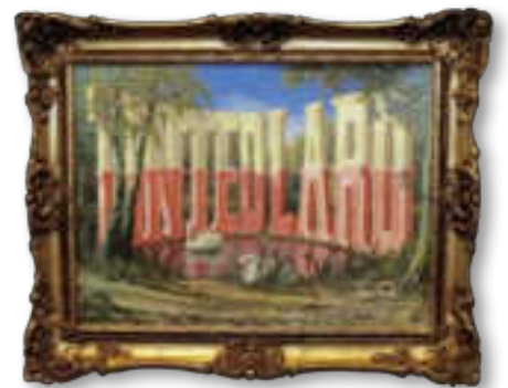
Tinted Lard , 2009, acrylic on offset lithograph, 18¾" x 25"