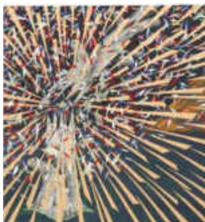
This Tree Fell and Made No Sound (detail), 2009, acrylic, iron, collage, spray paint and glitter on panel, 11½" x 11½".