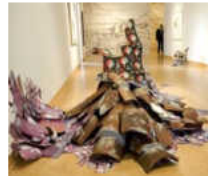
Mallorca, 2008, from Shape and Shatter at John Michael Kohler Arts Center, handmade tiles, steel, vintage Spanish roof tiles, photographs, dimensions variable.