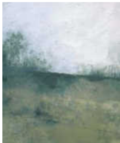
Siege (detail), 2002, acrylic on canvas, 50" x 50".