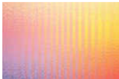
Blush/hybrid (detail), 2009, 151,276 pieces of colored acrylic plastic and glue, 71½" x 77½"

uninflected surfaces allow the visual depth of the underlying designs to recede into infinity; there is a peculiar hall-of-mirrors effect, as if the flickering acrylic tiles were actually part of a single grand structure endlessly reflecting itself. Zammitt's painting/constructions have been compared to ocean sunsets, but they reach well into outer space. —PF