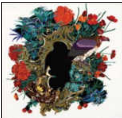
Gold Rush , 2008, colored paper, gouache, and acrylic on paper, 53 3/4" x 53 3/4". Courtesy the artist and Patrick Painter Inc., Santa Monica.