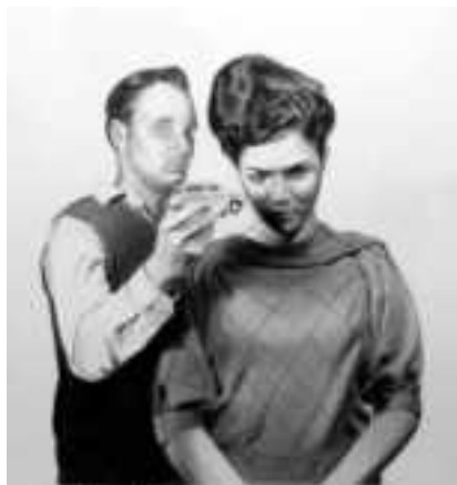
Man Holds a Car, 2009, black pencil on paper, 23" x 29".