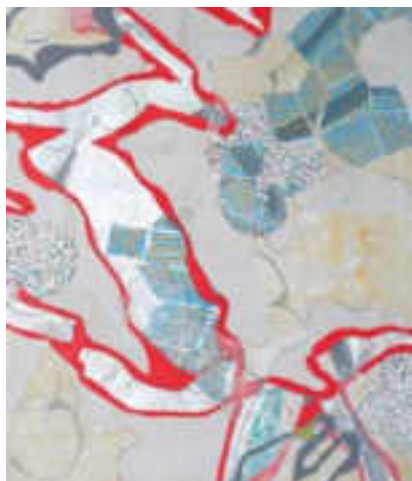
Preposition 4 (detail), 2009, acrylic, ink, mylar on paper, 22" x 15"